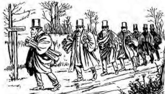
THE COURT ON ITS TRAVELS.

There were no more appointments until 1841, when the court was increased to nine members, and the Justices were again required to perform Circuit Court duties. From